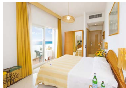
Bedroom Ecoresort - Le Sirenè