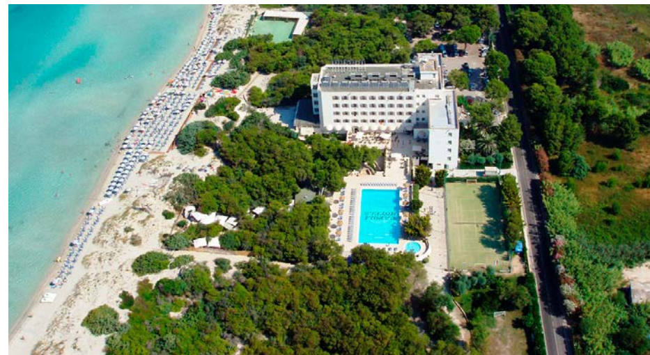
Hotel Ecoresort Le Sirenè by Caroli Hotels, located in a green oasis about 10 km from Gallipoli

*Free tourist stay, at Ecoresort Le Sirenè, in the 2026 edition of the 7-day event in full board (double room) + cup All cash prizes are indicated gross and will be paid to the winning player by bank transfer net, with the deduction of the Italian tax law.